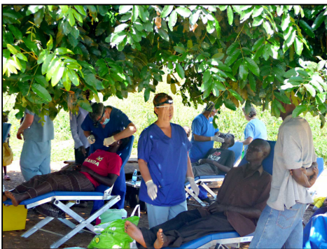
Portable chairs in use in Uganda