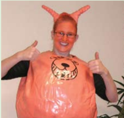
'Best costume' went to a member of Practice Plan, as part of a 70's themed day.

Thank you to all of you who supported Dress up day again this year, we always look forward to seeing your imaginative costumes...Here are a few of the best!