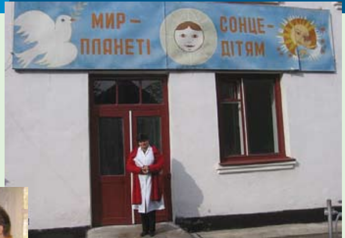
The Sanatorium has a massage room, physiotherapy and physical treatment rooms and a dental room.

radiation. The Sanatorium has a dentist who was previously trying to work with broken and limited items of