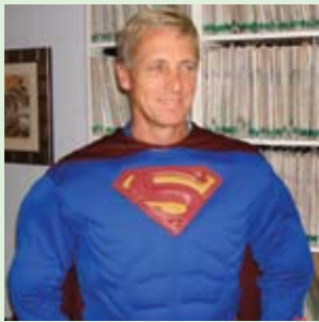
Kingsclere's TV character themed day certainly took off!