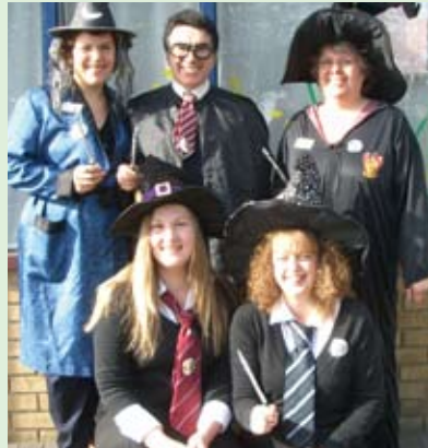
The team at Dartford Road Dental Centre worked their magic.