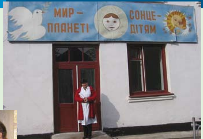
The Sanatorium has a massage room, physiotherapy and physical treatment rooms and a dental room.

radiation. The Sanatorium has a dentist who was previously trying to work with broken and limited items of