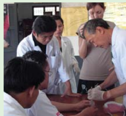
OUT training in LAO

Then in September 2007 I led a three week training programme in Lao. This involved training two indigenous doctors from the Lao Faculty of Medical Sciences and one from Mahosot Hospital in Oral Urgent Treatment (OUT). During the programme they effectively learned to apply what they were being taught whilst also mentoring three primary health care workers from local health centres who were also taking part in the programme. The training involved theoretical sessions in which I gave presentations, demonstrations and presented case studies on a large array of topics, including the prevention