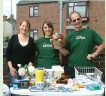
'Best fundraiser' went to Dentith & Dentith in Oakham for raising £425, this included money raised from a table top sale on the day.