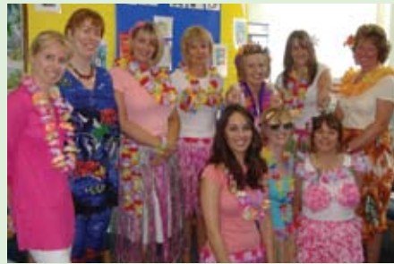
Yoevil Access Centre danced the hula hula for DentaId.