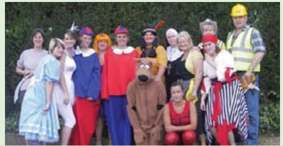
'Best theme' was Oxford House in Milton Keynes for their Cartoon characters day.