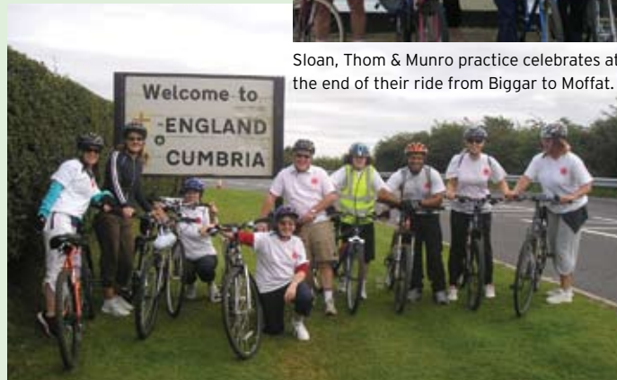
Sloan, Thom & Munro practice celebrates at the end of their ride from Biggar to Moffat.

In September 2007 over 30 dental practices successfully took part in The John O' Groats to Land's End bike ride. The 874-mile journey began in John O' Groats, and cyclists arrived in Land's End in Cornwall 9 days later. The famous journey saw 5 riders completing the whole route with almost 150 riders meeting them along the way to complete 25-mile sections. Money raised has