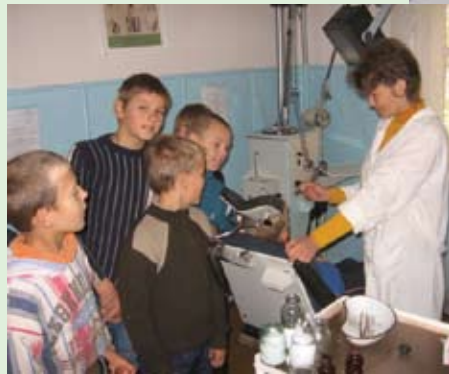
The sanatorium's dentist treating some of the children before the new surgery arrived.

A large number of the children live in Chernobyl infected areas and need special care and attention. Therefore every month around 300 children pass through the Sanatorium where they receive better food and treatment that enables them to resist TB infections. Many of the children have never seen a dentist and have serious problems with their teeth, largely due to a poor diet and the effect of