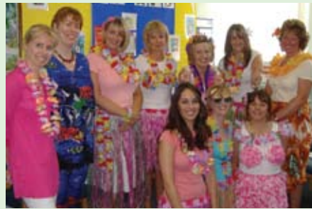
Yoevil Access Centre danced the hula hula for Dentaaid.