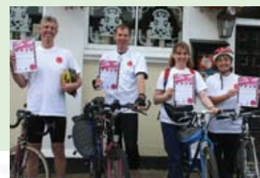
Sloan, Thom & Munro practice celebrates at the end of their ride from Biggar to Moffat.

reached over £20,000 and is still coming. The event was organised as part of the Dentaid/Denplan partnership and we would like to say a big thank you to everyone who took part.