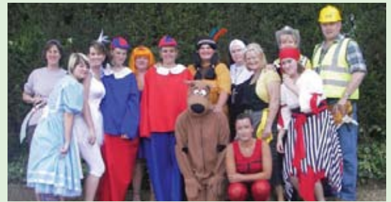
'Best theme' was Oxford House in Milton Keynes for their Cartoon characters day.