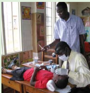
ART training in Uganda

Training has been a big part of my work since our last newsletter; firstly I travelled to Uganda and trained trainers at the Mulago dental school in Atraumatic Restorative Treatment (ART) and cross infection control. Within three days the trainers were able to carry out the work themselves, which was very exciting to see. No special equipment is needed for ART treatment - only hand instruments, ART material, tables and chairs. Therefore it is a form of restorative treatment that can be provided without dentists and clinics relying on electricity - unavailable to most of the world's population.