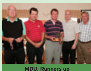
MDU, Runners up