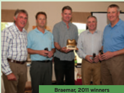
Braemar, 2011 winners

Unfortunately nobody won the hole-in-one competition and so the car had to be returned to the Fiat garage. Maybe next year.