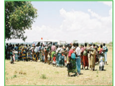
Mobile clinic queue

Malawi is a small landlocked country in South East Africa. It has a population of approximately 12 million with 50% under 15 years of age. According to the World Health Organisation it is the 10th poorest country in the world. 80% of Malawians are subsistence farmers living in rural areas. Nearly half of Malawi's population struggles to live on less than $1 a day. There are over 1 million AIDS orphans and average life expectancy is just 45 years.