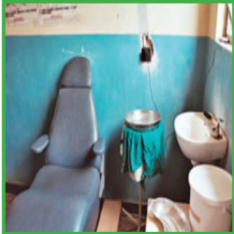
Existing dental surgery