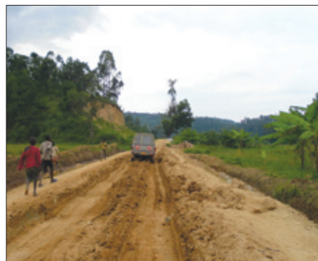
The trip was slow going at times

The trip would take them to 11 surgeries in 7 hospitals all the way across Uganda and the length of Rwanda. In total over 1000kms were covered by road and much of it on bumpy, pot hole filled dirt tracks. It was definitely an adventure!