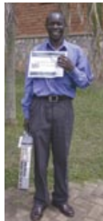
A graduating student

On completion of the course all students were awarded a certificate and a comprehensive tool kit at a formal presentation