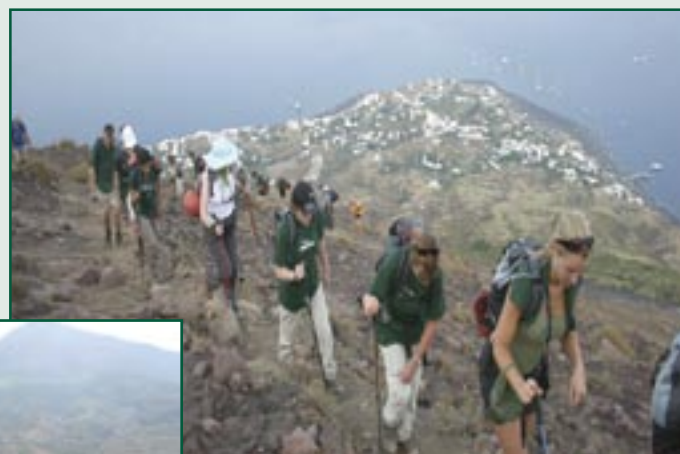
Facing the challenge head on

Here are some of the highlights from the trip log, which can be viewed in full at www.dentaid.org .