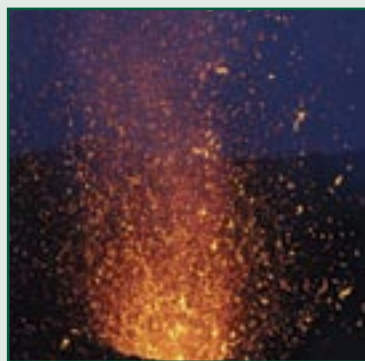
Natural fireworks on Stromboli

Dentaid's annual challenge trek proved a great success again this year. The team of 29 trekkers climbed all 3 volcanoes Mount Vesuvius, Stromboli and Etna over 5 tiring, but exhilarating days, which proved to be the experience of a lifetime for those involved.