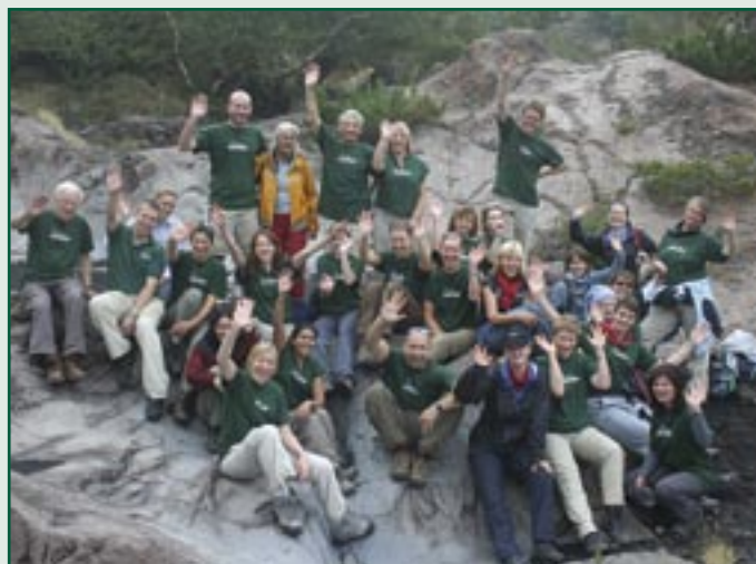
Trekking group sitting in a lava flow, Mount Etna

With over £30,000 raised so far and more sponsorship still to collect, the money raised by this event will help towards Dentaid's goals of developing major new initiatives in oral health promotion, training initiatives, advocacy and campaigning, which the charity believes are key to improving oral health in the developing world.