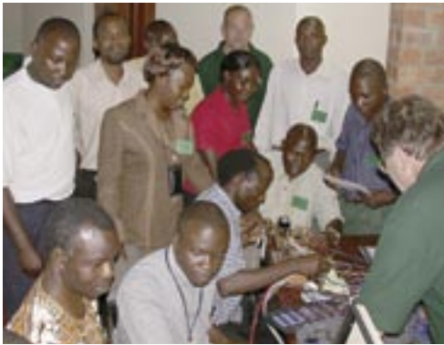
Training in action

When a dentist's equipment breaks down in the UK, it normally takes little more than a phone call and a few hours frustrating wait before an engineer arrives, the surgery is hopefully fixed and ready to see patients again. In the