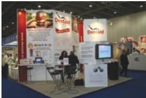
The Dentaid stand