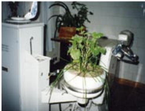
Not a Dentaid Surgery!

Over the last fifty years, thousands of tonnes of dental equipment, and millions of hours in direct volunteering or training advice, have been donated to the developing world. Yet today, there are more people living without oral health care provision than ever before. As diets have changed with the influx of western refined sugar products, children face futures with dental problems which their grandparents did not. Millions of people suffer daily from toothache and put their health and lives at risk though DIY extractions by untrained personnel in unsterile conditions. The horrific practice of removing unerupted teeth from the gums of babies (infant oral mutilation) continues and may even be on the increase. NOMA infections and other oral diseases remain a threat to the lives of hundreds of thousands of children each year.