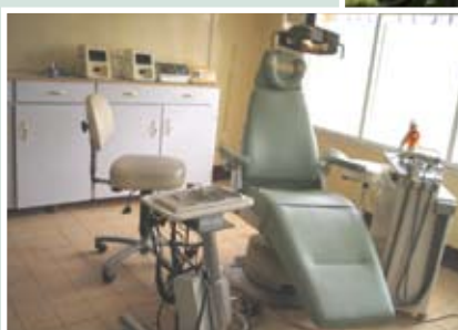
One of the new Dentaid surgeries

Dentaid's involvement will not stop here. Dentaid passionately believes that the provision of dental surgeries and the establishment of regional referral clinics is just one part of the overall oral health provision needed in countries like