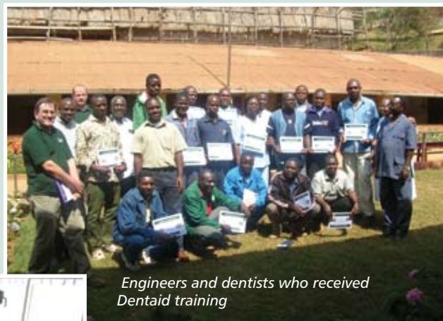
Engineers and dentists who received Dentaid training