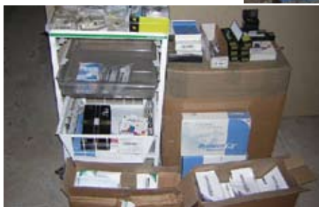
Henry Schein (crate pictured) and Minerva led the way with huge donations

It was especially frustrating for us when the scrap value of these instruments would perhaps yield £100 at most, but for us to replace them would cost well over £50,000. Dentaid sends instrument kits to dozens of charitable projects every year and for a time we thought our future work in this area was in jeopardy. But thanks to some very generous donations from the dental trade and practices we are pleased to tell you we are nearly back up to full capacity!