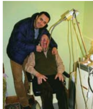
One of the dentists with a patient using the old surgery

Therefore working with UK based charity Blythswood Care, Dentaid has supplied a full dental surgery so the project is now able to work in the collective centres giving them free dental care. The project, which is working along side the Red Cross, will provide long term care for the patients and give them guidance on oral health and hygiene, as well as preventive care including regular scheduled check ups. They will also be developing special educational programmes for children.