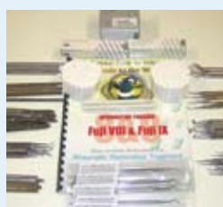
The Cordent ART kit

ART Kit - Atraumatic Restorative Treatment (ART) is a WHO endorsed method of providing simple fillings using hand instruments and Glass Ionomer (FUJI 1X). Not requiring electricity or sophisticated equipment or training, ART can be implemented by dentists or general health workers and is particularly appropriate to low income community environments.