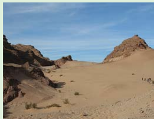
Trekkers climbing the sand dunes on day 3

Thank you to all of you who took part, you have raised over £28,000!