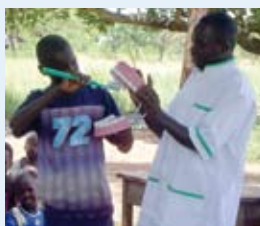
Demonstrating toothbrushing technique

Oral Health Promotion Kit - Designed for health workers to provide oral health promotion, particularly in low-income community settings like schools and health posts. It also includes a starter kit of toothbrushes and fluoride toothpaste.