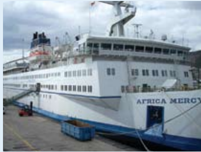
Africa Mercy ship docked in Lanzarote