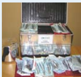
The Cordent instrument kit

At the end of 2007 The Cordent Trust disbanded and generously donated £17,500 to Dentaid and Bridge2Aid. To keep the Cordent name alive Dentaid has decided to offer specialist kits to overseas projects and volunteers. These kits will either be given to projects via subsidy or paid for by supporters who are volunteering overseas.