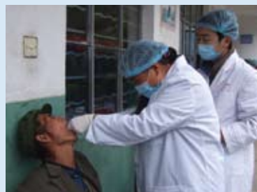
Practising an extraction