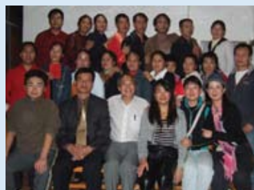
Celebration as the group passes the course