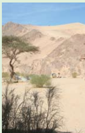
Sinai trek 2007

In November 2007 25 Dentaid supporters took on the challenge of climbing Mount Sinai and then trekking through the Sahara desert to raise money for our work. Over the week the trekkers experienced the awesome spectacle of the sun setting over the Sahara, took an exhilarating jeep ride through sand dunes and immersed themselves in the immense solitude and awe inspiring grandeur of the desert landscape, including trekking through sand dunes, winding dry riverbeds and craggy mountainous outcrops.