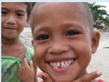
A little boy with poor oral health