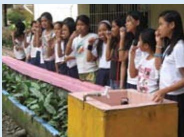
Some of the pupils brushing their teeth as part of the programme