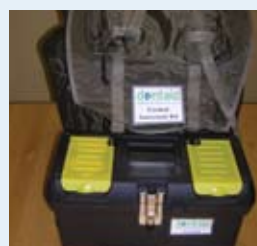
The kits are available in a rucksack or an aluminum case.

ART and OUT Kit - This kit combines the main elements of all the above kits, to enable a single practitioner to provide a holistic oral health service to the community he/she serves. This is likely to be appropriate for resident health workers in rural communities.