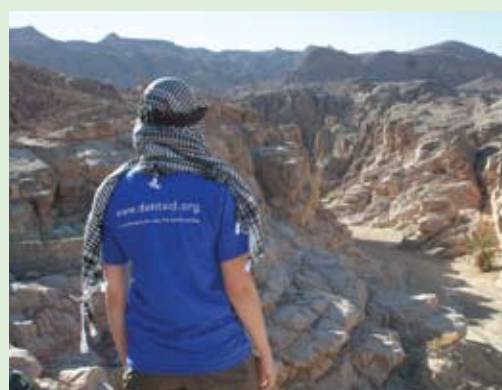
A trekker looking out over the landscape