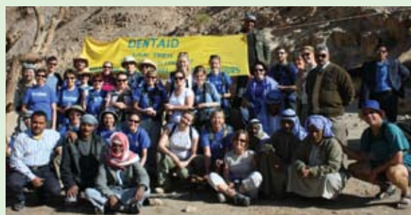
The group celebrating at the end of the trek

crowded with ancient and charismatic cars, donkeys and horses, vivid shops selling Egyptian cotton and fragrant perfumes.