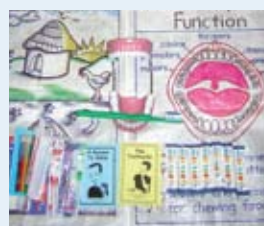
Oral Health Promotion kit